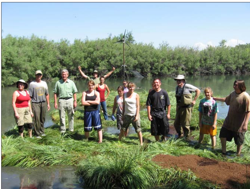
Senator Max Baucus third from left.

http://www.floatingislandinternational.com/fi_pages.php?name=m60