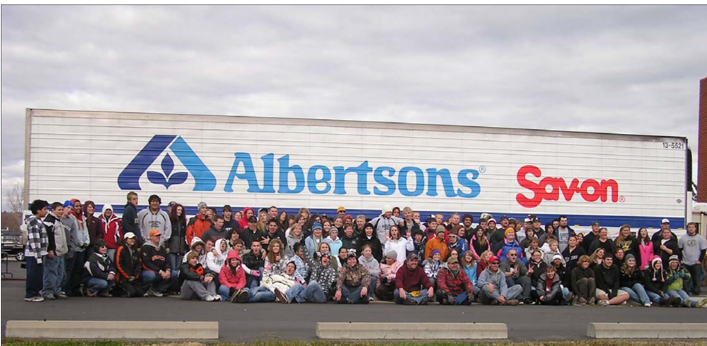
The group of Flakesgiving volunteers including 41 TRIO students.