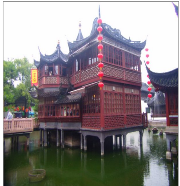
Yuyuan Garden in Shanghai