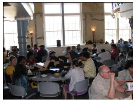
Participants in the money myths workshop

It was an exciting day for the EOC, a value for the Community, and another great stride for educational equity and access for all!