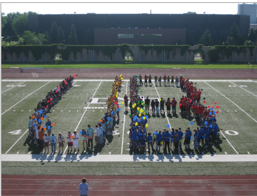
UB Students at Olympic Opening Ceremonies

Engelstad Arena. The awards ceremonies were held after the evening meal. North Dakota State University was the winner of the Spirit Stick an award given to the program with the best “Spirit.” Saturday evening concluded with activities at the Memorial Union on the UND campus. Students could participate in a talent show, have their photo taken in the photo booth, play pool, or dance the night away!