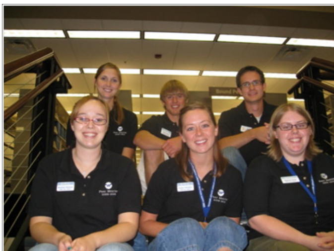
DWU TRIO Peer Mentors at the TRIO Welcome Event