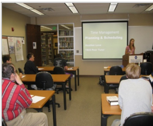
TRIO tutor presenting time management skills