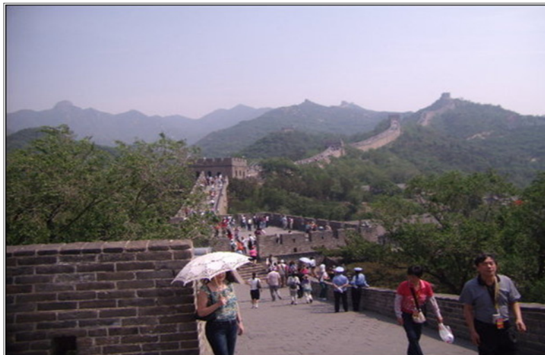
Tourists on the Great Wall of China