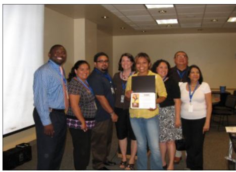
EOC Staff with the recipient of the annual Pathways Scholarship