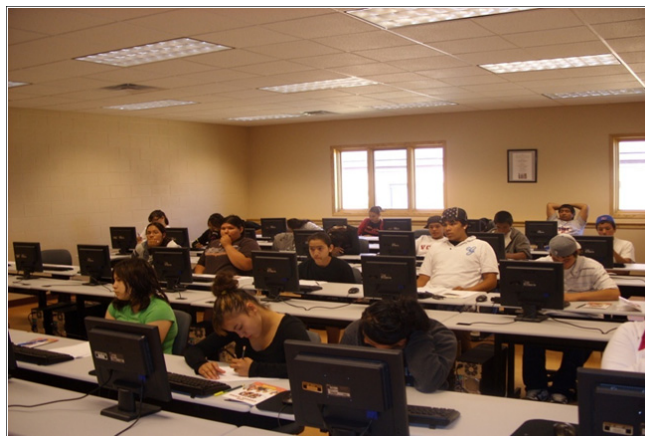
Students engage in career assessment and resume writing workshops given by TS advisors.

The CCCC Talent Search program in collaboration with the Jobs & Training program provided activities for the Summer Youth Program for four weeks in the month of July. It kicked off with an orientation for 105 students at the Fort Totten Recreation Center. Each of the four weeks, the advisors provided career and college information, interviewing/resume writing skills, career assessment, leadership activities through Boy Scouts of America, cultural tours of the Calvary Square and Sully’s Hill, and college tours of Cankdeska Cikana Community College and Valley City State University. The program ended with a final farewell picnic for all students with games and prizes for all!