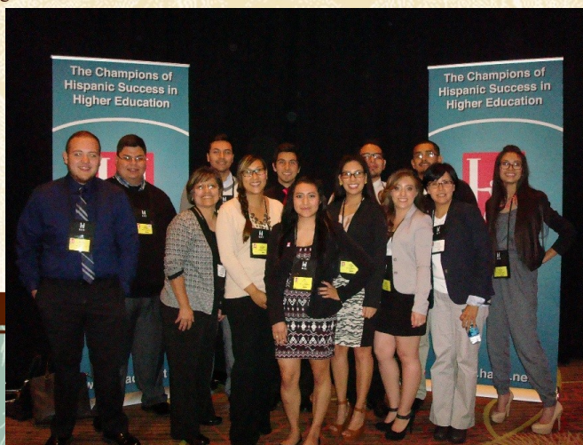
CHE Participants with other UNC students and staff