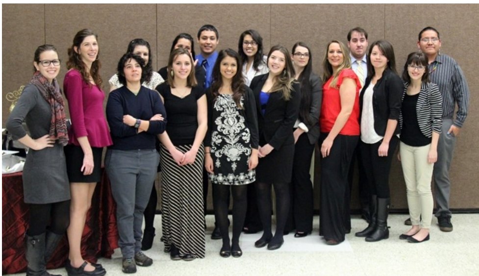
Student presenters at the 5 th annual McNair Scholars Research Symposium on December 2 nd , 2014

Other McNair students presented their research at the 5 th annual McNair Scholars Research Symposium on such topics as grandparents raising grandchildren, licorice extract's effect on bacteria, reviving Native American languages, art history and promoting safe teen driving.