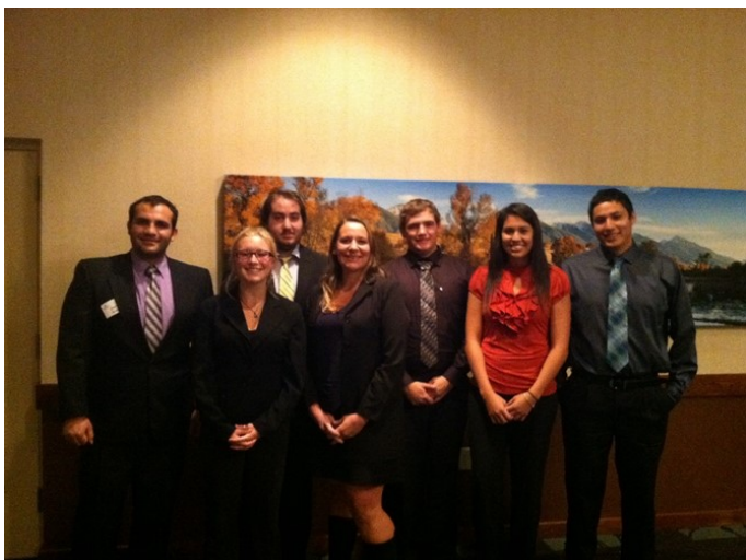
McNair Scholars attended the annual Margaret Alderson Etiquette Dinner on October 9 th, 2014.

On October 9th, 2014 the MSU McNair Scholars attended the annual Margaret Alderson Etiquette Dinner. This dinner is sponsored by MSU's Allen Yarnell Center for Student Success: Career, Internship & Student Employment Services. Each year, this etiquette and interview dinner is the kick-off for Career Week at MSU. McNair Scholars and other participating students from across campus had the opportunity to gain interviewing experience and learn the "how to" of formal dining. The evening included a four course meal, small group etiquette instruction, and mock interviews.